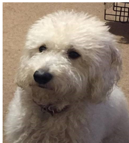
Teddy, the school dog

The team are creative when it comes to supporting children with choosing healthy foods and look at ways of making mealtimes fun, whether it be encouraging the children to join in with cooking, baking and preparing the food with staff support, or finding fun ways to encourage children to try foods they are not used to or usually don't like eating.