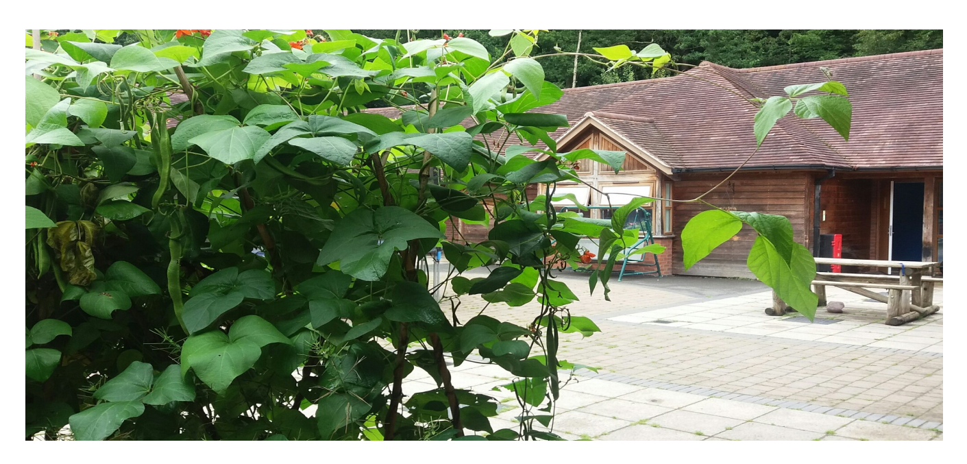
Green Beans at Cedar Lodge planted by residents.